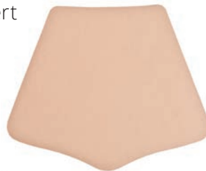
HEAT MOLDABLE INSERT