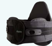
Aspen Horizon™ 637 LSO Aspen Horizon™ 631 LSO