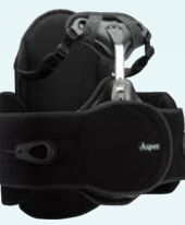
Aspen Sierra™ TLSO 464