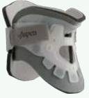
Aspen® Collar Aspen® Pediatric Collars