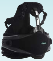
Aspen Vista™ 464 TLSO

Fracture management Structural kyphosis Spondylolisthesis Spinal stenosis Spondylosis