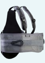
Aspen OTS™ TLSO 457