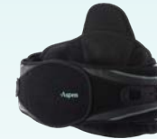
Aspen Vista™ 637 LSO Aspen Vista™ 631 LSO LoPro

Fracture management Spinal stenosis Sprains / strains Facet syndrome SI dysfunction Radiculopathy Spondylosis Sacroiliitis Injections