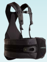
Aspen Horizon™ 456 TLSO