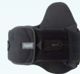
Aspen Evergreen™ 637 LSO Aspen Evergreen™ 631 LSO LoPro