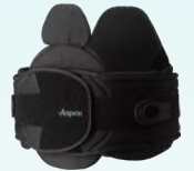
Aspen Horizon™ 639 LSO