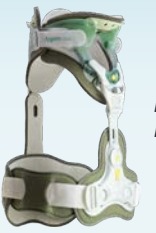
Aspen Vista™ CT04 Aspen Vista™ CTO