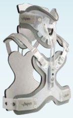
Aspen® CTO Aspen® Pediatric CTO