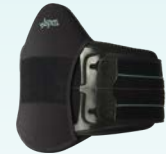
Aspen Summit™ 637 LSO Aspen Summit™ 631 LSO