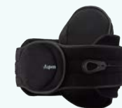
Aspen Sierra™ LSO 637