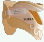
Aspen Sierra™ Universal Collar Aspen Sierra™ Pediatric Collar