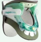
Aspen Vista™ Collar Aspen Vista™ ICU (Back Panel Only)

Sprains / strains Radiculopathy Neck pain Whiplash Trauma