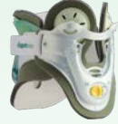
Aspen Vista™ MultiPost