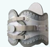
Aspen® LSO Aspen® LSO LoPro