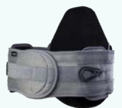
Aspen OTS™ LSO 650 Aspen OTS™ LSO 648