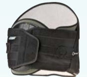
Aspen Contour™ LSO