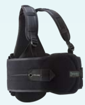
Aspen Evergreen™ 456 TLSO